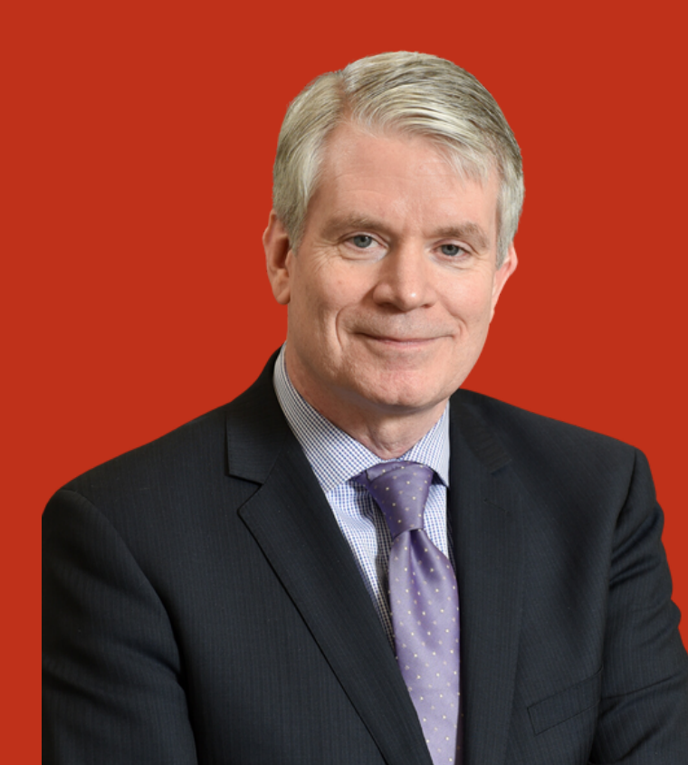
President and CEO ACEC-Canada